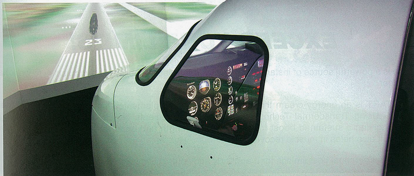
Above: Inside the hangar at the Australian Airline Pilot Academy. Below: Pilots are trained with flight simulators before they leave the ground.

"This approval is further affirmation of AAPA's reputation as one of the finest flight training establishments in the world."